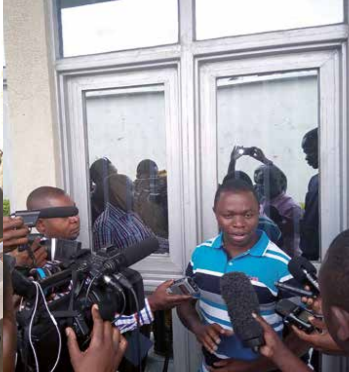
... Congolais pour la Conservation de la Nature (ICCN) (PNVI), appuyé par Virunga Foundation 2022